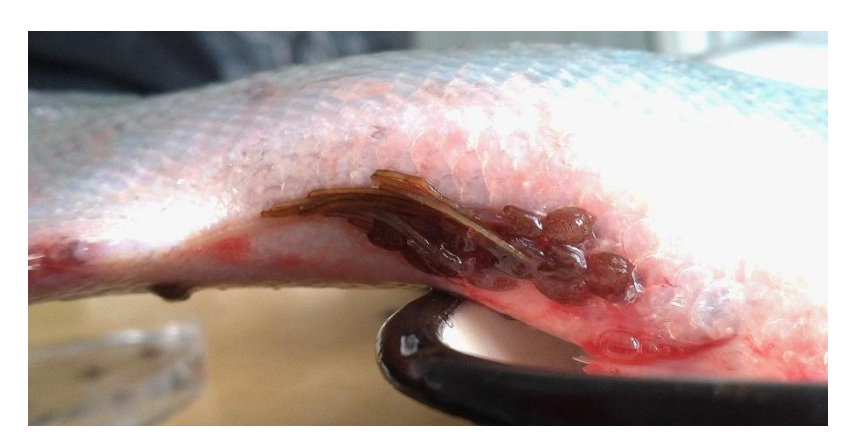
Figure 2 . Place of attachment of Lepeophtheirus salmonis to the host (Atlantic salmon).

These parasitic crayfish live and eat slime, tissues and blood of the host (figure 2), reducing efficiency of transformation of food to a gain and causing damages of covers of a body which are secondary affected by bacteries and mushrooms and also cause the general immunosuppression of the organism, at the same time crustaceans can be carriers of dangerous diseases so at a high level of infection fish can be lost. For ectoparasites with free living stages of life, such as L. salmonis, search of the owner is an adaptive and evolutionary process which is crucial for end of a life cycle and survival of a species. Salmon louses use a combination of mechanical, visual and chemical touch signals for identification and detection of potential owners.